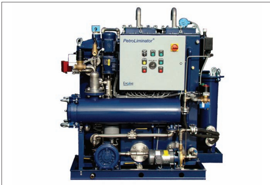
The PetroLimiter OWS from EnSolve Biosystems, Inc.

EnSolve’s novel PetroLimiter OWS consists of three stages: Stage I physically separates and removes the non-emulsified oil via an advanced coalescing matrix. The influent stream enters the inlet chamber where water turbulence and velocity are sharply reduced, and initial gravimetric separation occurs. As the bilgewater flows